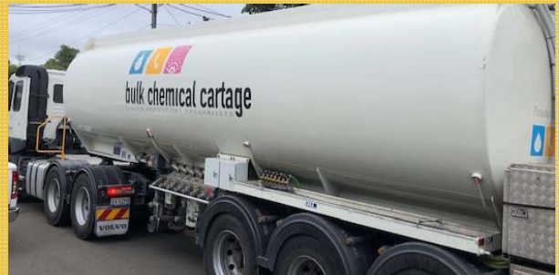
Chemical Delivery Tankers