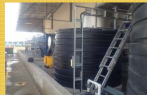
Batch Controllers + Magmeters for safely dispensing chemicals