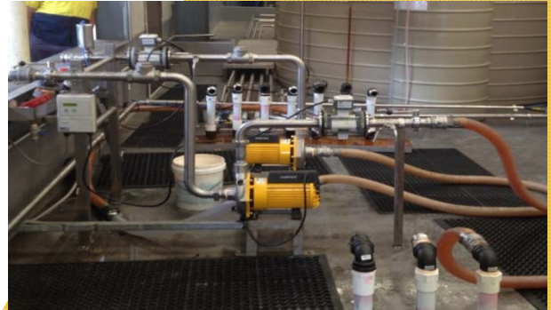
Admixture Production Plants

Locations include: Australia, Chile, Dubai, Egypt, Saudi Arabia, Bahrain, Indonesia, Malaysia, Philippines, Vietnam, Thailand, Laos, China, HK, Singapore, Burma, NZ Fiji, PNG and many other sites worldwide.