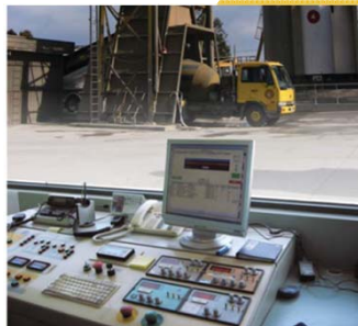
Batch Controllers/interface cards for safely dispensing admixtures