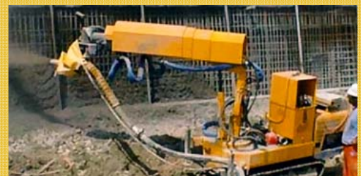
ManuFlo Flowrate indicator flowmeter Installed on a shotcrete spray rig.