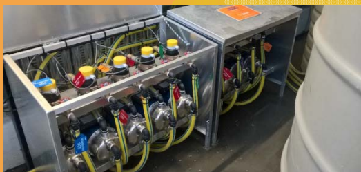
8x MES20 admixture flowmeters Install at Premix Concrete plant