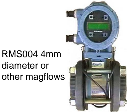
RMS004 4mm diameter or other magflows