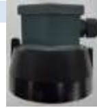
1. Digital DSP pulsehead

NOTE: A full complement of spare parts is available.