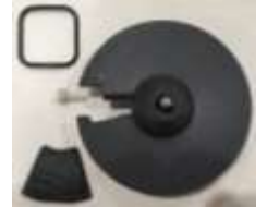
4. Wobble Disc / Shutter / Roller (internals of Measuring Chamber)