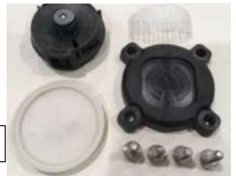
5. Measuring Chamber Complete 3. Strainer

MES20-DSP-OC or MES20-DSP Identifier label located on lid