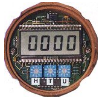
Internal view of calibration HTU switches