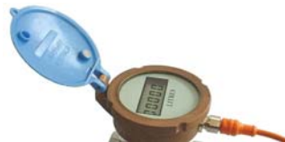
Shown with optional IP67 Pulse Output plug set

Pulse Output cabling: BLACK = pulse (Collector), BLUE = 0v (Emitter)